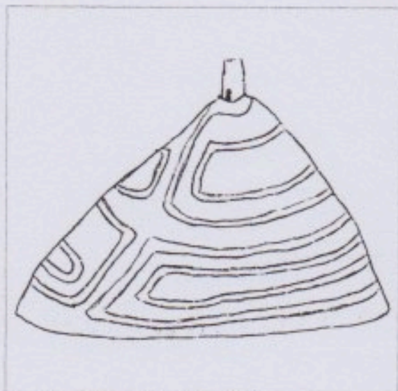
The Glastonbury Tor Maze (JW)

Word roots linking the sun, the ground and point of contact between foot and ground - the sole. All this seems to suggest an ancient association between sun, ground and sole and evidence to support this can be found in the shape of the feet and spiral carvings found at some megalithic sites. The Taoist shaman sorcerers, whilst in a trance state, used to perform a spiral