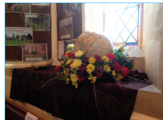
Top left: Water energy. Top right: Earth energies. Bottom right: both windows and our banner. All 2015. Bottom left: Delphiniums representing a water fountain, and chrysanthemums as earth energy spirals, both 2010.